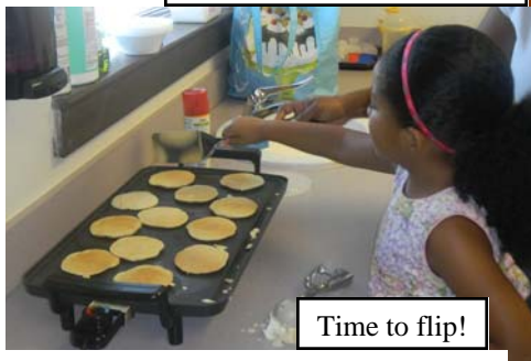
Time to flip!