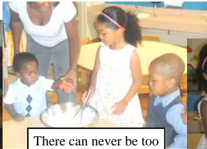
There can never be too much cinnamon!!