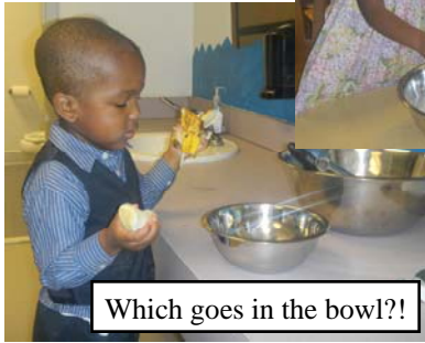
Which goes in the bowl?!