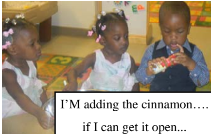
I'M adding the cinnamon.... if I can get it open...

PANCAKE DAY IN THE NURSERY When you walk down the hall and smell sweet cinnamon-y goodness, you know it's Pancake Day in the nursery! We explored all of our senses as we made the yummy treat. Soft bananas, sweet cinnamon, goey maple butter and warm pancakes are always a hit!