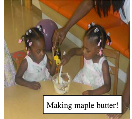
Making maple butter!

Drop off your little one ages 5 and under during worship service. You never know what kind of fun we'll have in store!